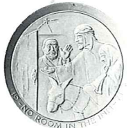
1971 "No Room in the Inn"