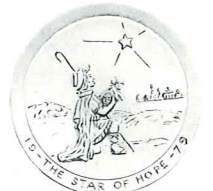
1979 "The Star of Hope"