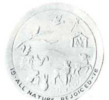
1978 "All Nature Rejoiced"