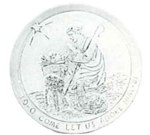
1981 "O, Come Let Us Adore Him"