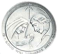
1965 "Good Will Towards Men"

AMERICA'S FIRST ANNUAL LIMITED EDITION CHRISTMAS PLATE SERIES