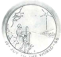
1966 "Bethlehem Shepherds"