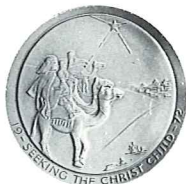
1972 "Seeking The Christ Child"