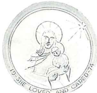
1974 "She Loved and Cared"