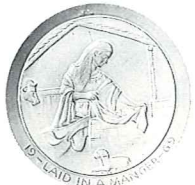
1969 "Laid in a Manger"