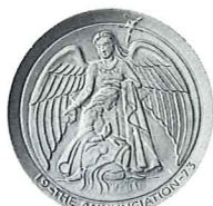
1973 "The Annunciation"