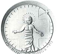
1970 "King of Kings"