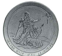
1982 "The Wise Men Rejoice"