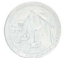
1983 "The Wise Men Bring Gifts"