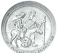
1968 "Flight into Egypt"