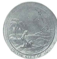
1976 "The Gift of Love"