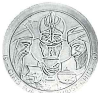
1967 "Gifts for The Christ Child"