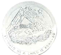
1980 "Unto us a Child is Born"