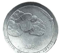
1977 "Birth of Eternal Life"