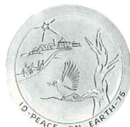
1975 "Peace on Earth"